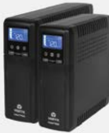
Vertiv™ Liebert® PSA5 UPS Line-interactive Micro-Tower, 500-1,500VA