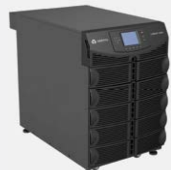
Vertiv™ Liebert® APS UPS On-line Scalable Rack/Floor-Mount, 5-20kVA