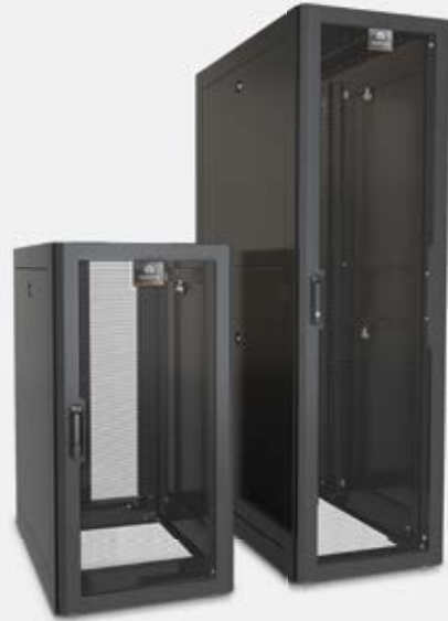
Vertiv™ DCE Rack