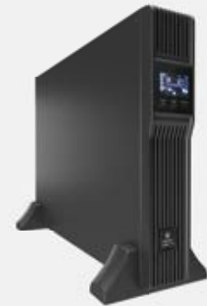
Vertiv™ Liebert® PSI5 UPS Line-interactive Rack/Tower, 800-5,000VA