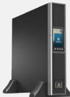
Vertiv™ Liebert® GXT5 online double conversion Rack/Tower UPS, 500-10,000VA